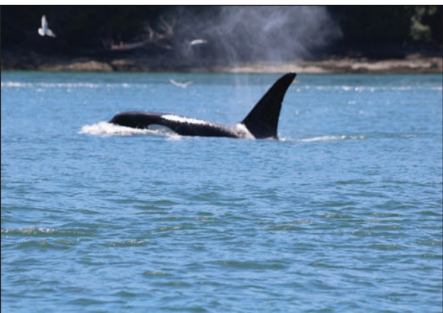
A whale makes a dramatic entrance above the ocean surface.

Whale-watching in B.C. is a huge industry and every time you go for it, you'll find several other vessels in the whale watching area, each boat respecting the gentlemen's rule of not going too close to the whales. Sidney is considered to be the best place in the world to have a whale-watching adventure because of its moderate climate and because it is located in the middle of orca whale foraging grounds.